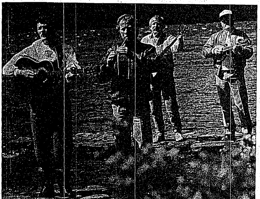
The Wolfe Tones who launched their new "Greatest Hits" album at Bellewstown Races last week.

The Wolfe Tones appear at Cork's Siamas Cois Laoi later this month.